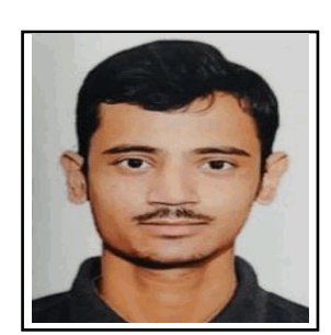
Ad Saguib flusznim